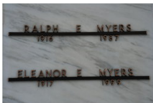
Added by gladwin gal